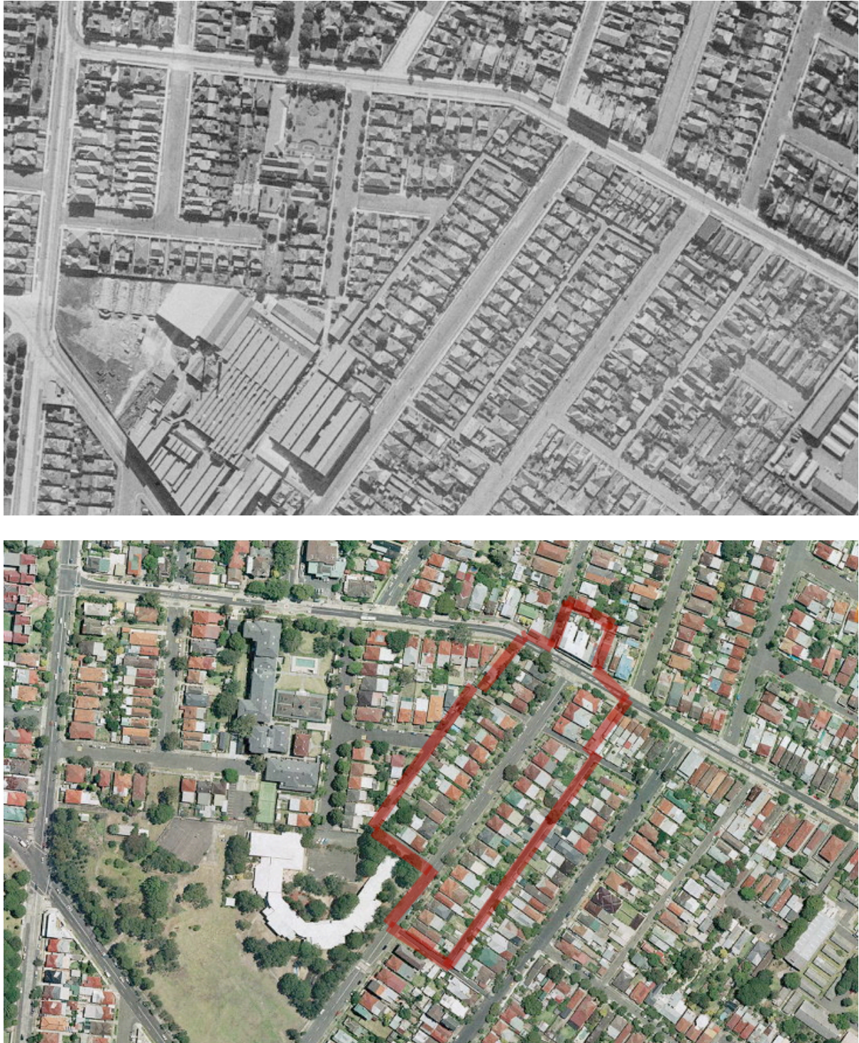
Figure 19.2 The Area in 1943 and 2009

The Norwood Park Estate Heritage Conservation Area is located in the northern part of Marrickville near Addison Road. It is a small area focused on Park Road north of Norwood Lane and Wilkins Public School.