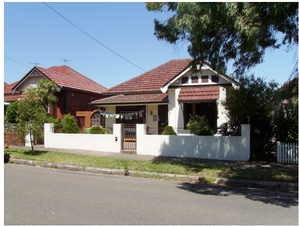
Figure 19.17. This Inter-War Californian Bungalow was built of the rare Manganese blue-black brick is an excellent example of its type and.