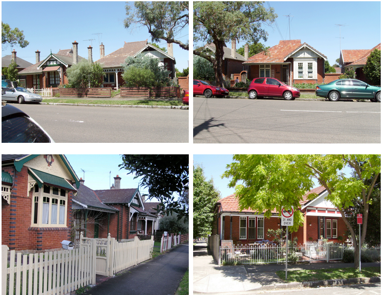
Figures 19.5 to 19.18 (over page) illustrate examples of the houses found within the area. Note the consistency within the groups of different architectural styles and the importance of chimneys in the streetscape view. Many of the fences are more characteristic of the Inter-war period, being low brick walls with worked iron or steel infill panels. Others are flat-topped timber picket fences, likely to have been replaced over the years.