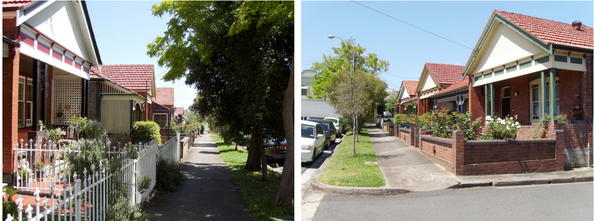
Figure 19.3 and 19.4. The Norwood Park Estate Heritage conservation area is a good example of the early suburban development of Marrickville. All properties are detached and the streetscape rhythm is defined strongly by the prominent gables and roof forms.